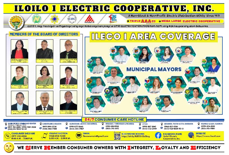
One of the premier electric Cooperative and service provider in the region by 2027. **MISSION** To provide quality, reliable and cost-effective electric service to Member-Consumer Owners for a progressive community. **Service Provider of the Premier electric Service and Service Provider of the Premier electric Service of the Premier electric Service of the Premier electric Service of the Premier electric Service of the Premier electric Service of the Premier electric Service of the Premier electric Service of the Premier electric Service of the Premier electric Service of the Premier electric Service of the Premier electric Service of the Premier electric Service of the Premier electric Service of the Premier electric Service of the Premier electric Service of the Premier electric Service of the Premier electric Service of the Premier electric Service of the Premier electric Service of the Premier electric Service of the Premier electric Service of the Premier electric Service of the Premier electric Service of the Premier electric Service of the Premier electric Service of the Premier electric Service of the Premier electric Service of the Premier electric Service of the Premier electric Service of the Premier electric Service of the Premier electric Service of the Premier electric Service of the Premier electric Service of the Premier electric Service of the Premier electric Service of the Premier electric Service of the Premier electric Service of the Premier electric Service of the Premier electric Service of the Premier electric Service of the Premier electric Service of the Premier electric Service of the Premier electric Service of the Premier electric Service of the Premier electric Service of the Premier electric Service of the Premier electric Service of the Premier electric Service of the Premier electric Service of the Premier electric Service of the Premier electric Service of the Premier electric Service of the Premier electric Service of the Premier electric Service of the Premier electric Ser