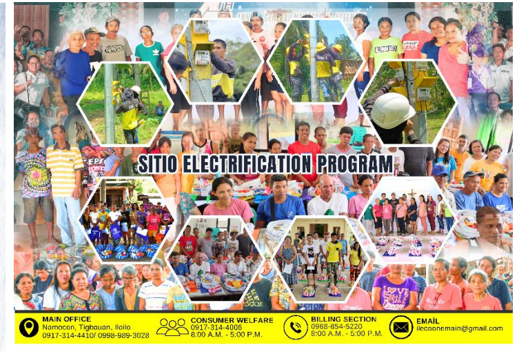
INSIDE BACK (TABLE CALENDAR)

NOTE: inside back image varies every month.